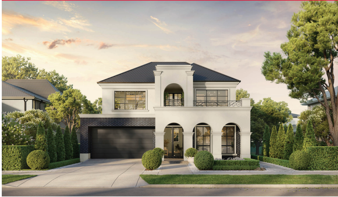
CASTLEMAINE 41 | ELITE RANGE