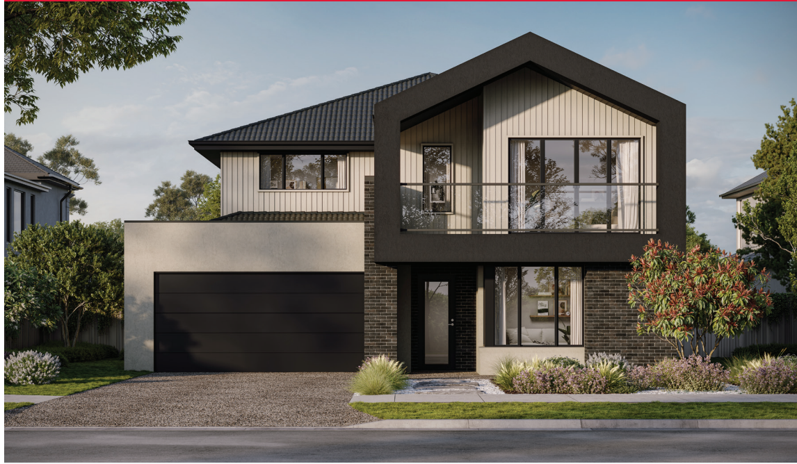
GRESSWELL 41 | ELITE RANGE