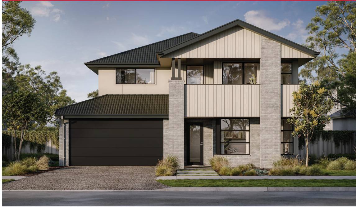
GRESSWELL 41 | ELITE RANGE